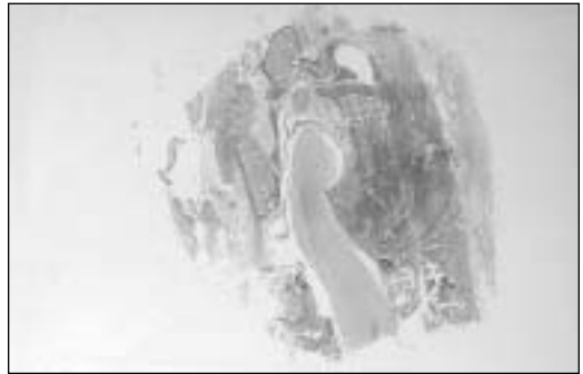
Fig. 4 - Deviation of the medulla: this is not compromised by the inflammatory process

The spinal medulla in the corresponding areas, although compressed and showing reflexive phenomena affecting the fibers, was not compromised by the inflammatory process (Fig. 4).