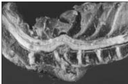
Fig. 1 - Vertebral compression and deviation of the medulla

The pressure of the vertebra on the medulla had, in addition to the compression, provoked an "S" shaped deviation of the medulla itself (Fig. 1).